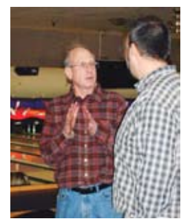
"...the approach is the most important part of bowling..."